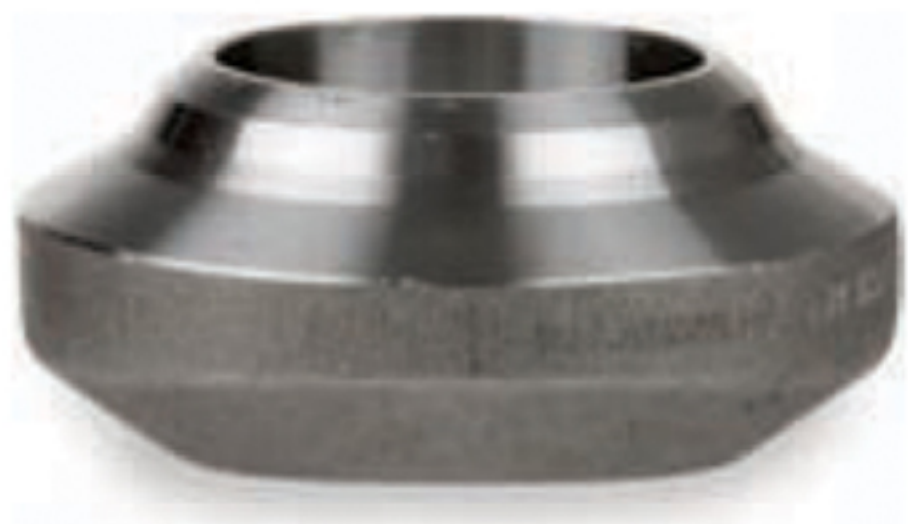
Fig. 43W03 – Welded Outlet